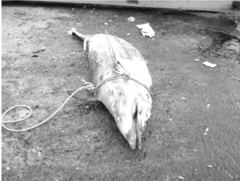
Fig. 4. A specimen of striped dolphin tied with a rope around its pectoral fins and head.