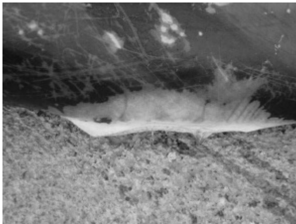
Fig. 5 Mutilation of the dorsal fin