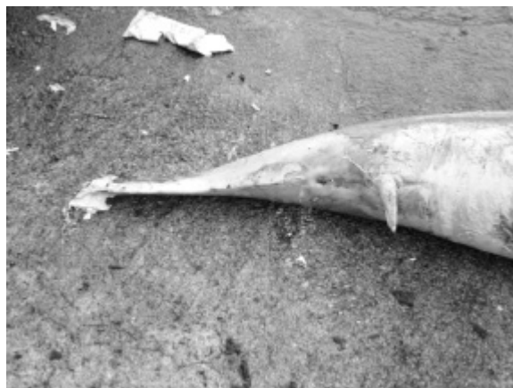
Fig. 6 . A tail cut off