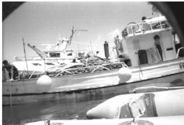
Fig. 2 Fishermen working on the net in the harbour